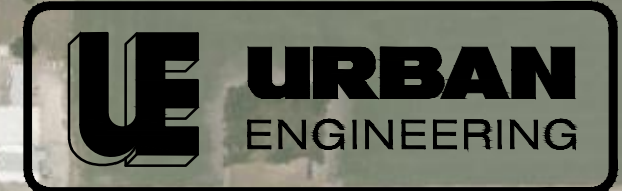
EXHIBIT OF PROPOSED UTP AMENDMENT

TBPE FIRM NO. 145, TBPLS FIRM NO. 10032400 2725 SWANTNER DR, CORPUS CHRISTI, TX 78404 PHONE: 361.854.3101 WWW.URBANENG.COM