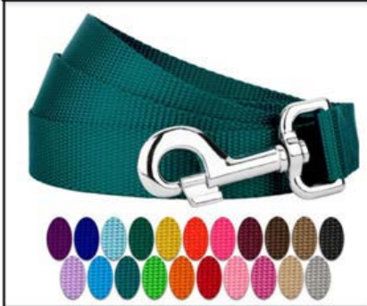
Nylon Leash 6ft.