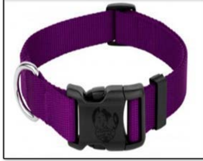
Adjustable Nylon Dog Collar