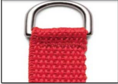
Flat Leash with D Ring 52 in.