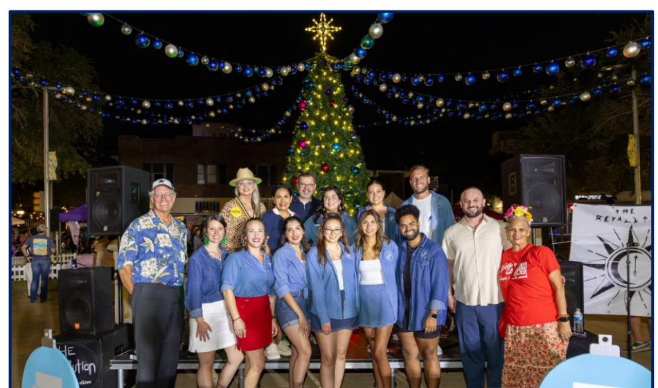
*Christmas Décor & FSG