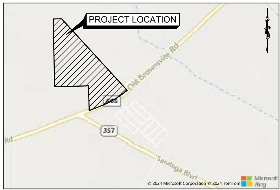
LOCATION MAP SCALE: 1" = 2,000'

STATE OF TEXAS COUNTY OF NUECES THIS FINAL PLAT OF THE HEREIN DESCRIBED PROPERTY WAS APPROVED ON BEHALF OF THE CITY OF CORPUS CHRISTI, TEXAS BY THE DEPARTMENT OF DEVELOPMENT SERVICES. THIS THE _____ DAY OF _____ 2024.