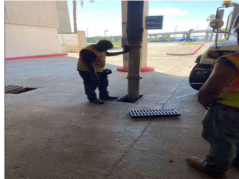
Flooding in the parking garage after rains.