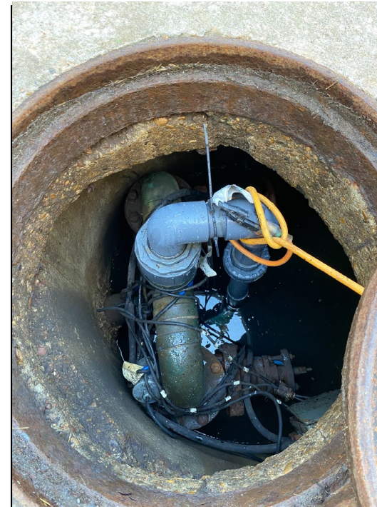
Temporary Fix Sump Pump