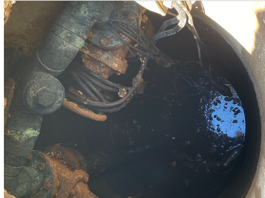
Existing Non-Functional Pumps