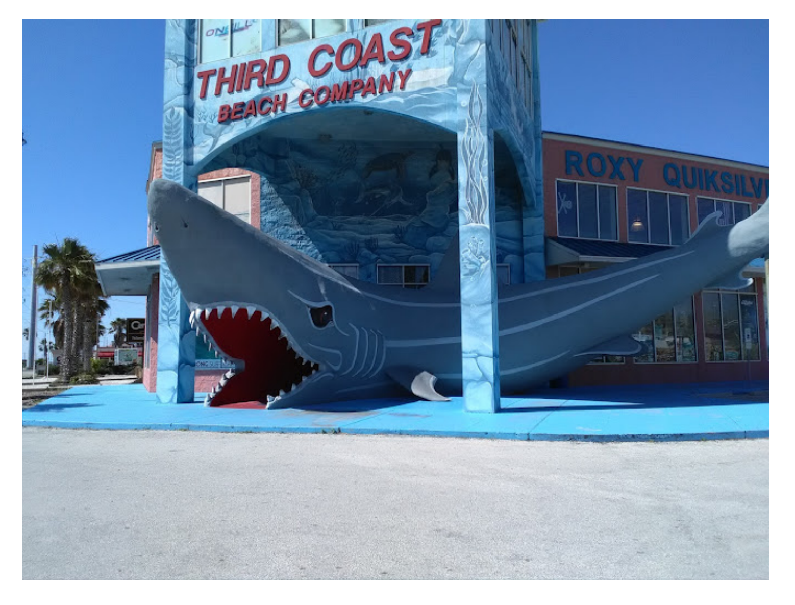
Most Photographed Location