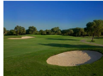
Lozano – Hole #17, #12, #6