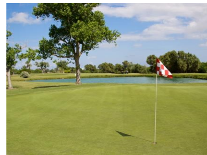
Oso Beach – Hole #1, #13 #12