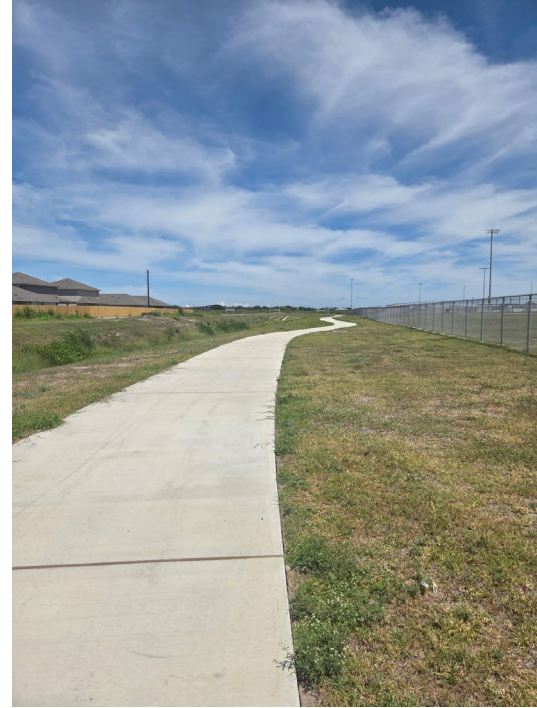
Extension of Existing Hike & Bike Trail