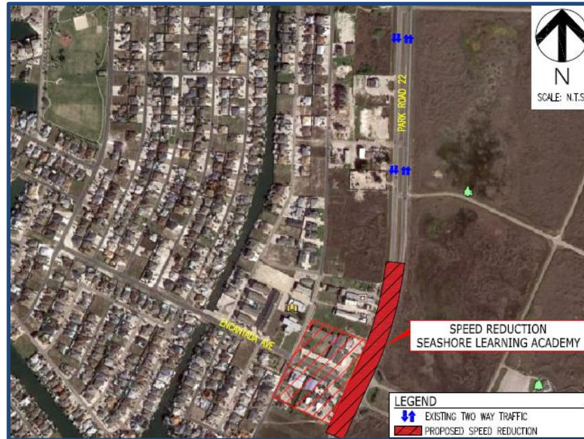
Speed Reduction – PR 22 – Seashore Learning Center