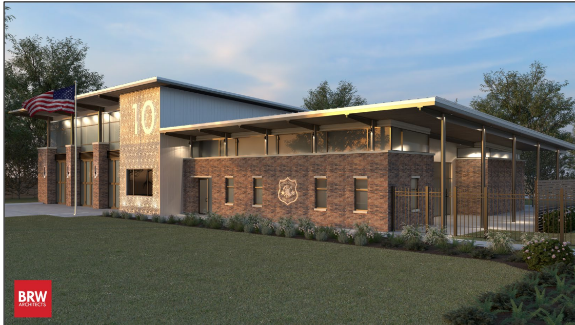
Proposed design rendering