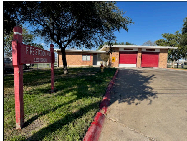
Driveway apparatus bays and main entrance