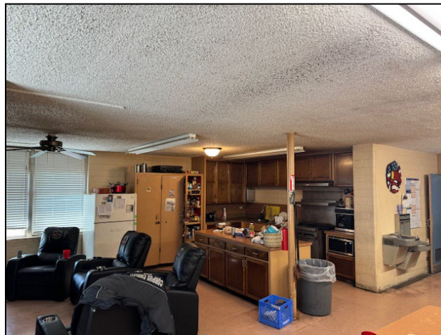
Restrooms, kitchen-dining, and common area