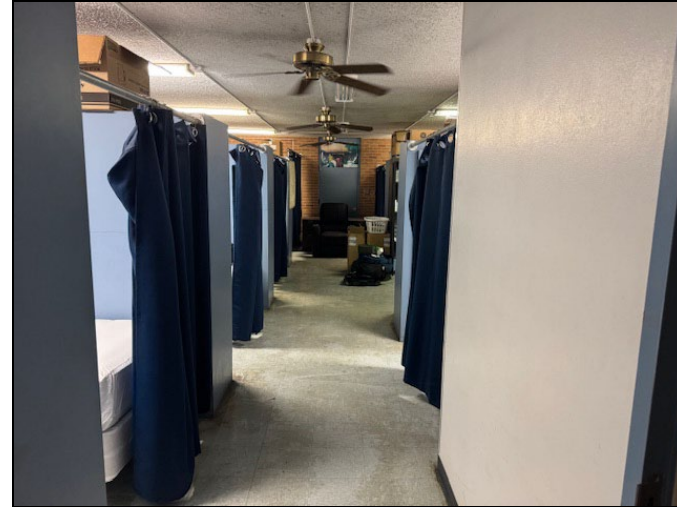
Captain's office and staff dormitories