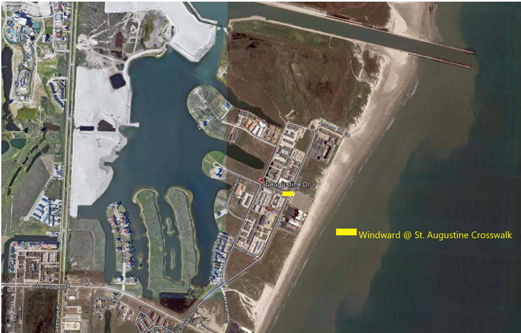
Windward @ St. Augustine Crosswalk