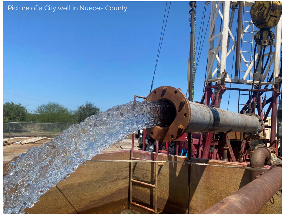
Picture of a City well in Nueces County.