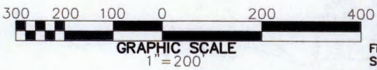
Exhibit B Sketch to Accompany