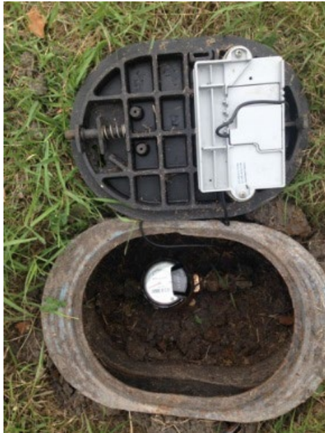
Meter Transmission Unit (MTU)