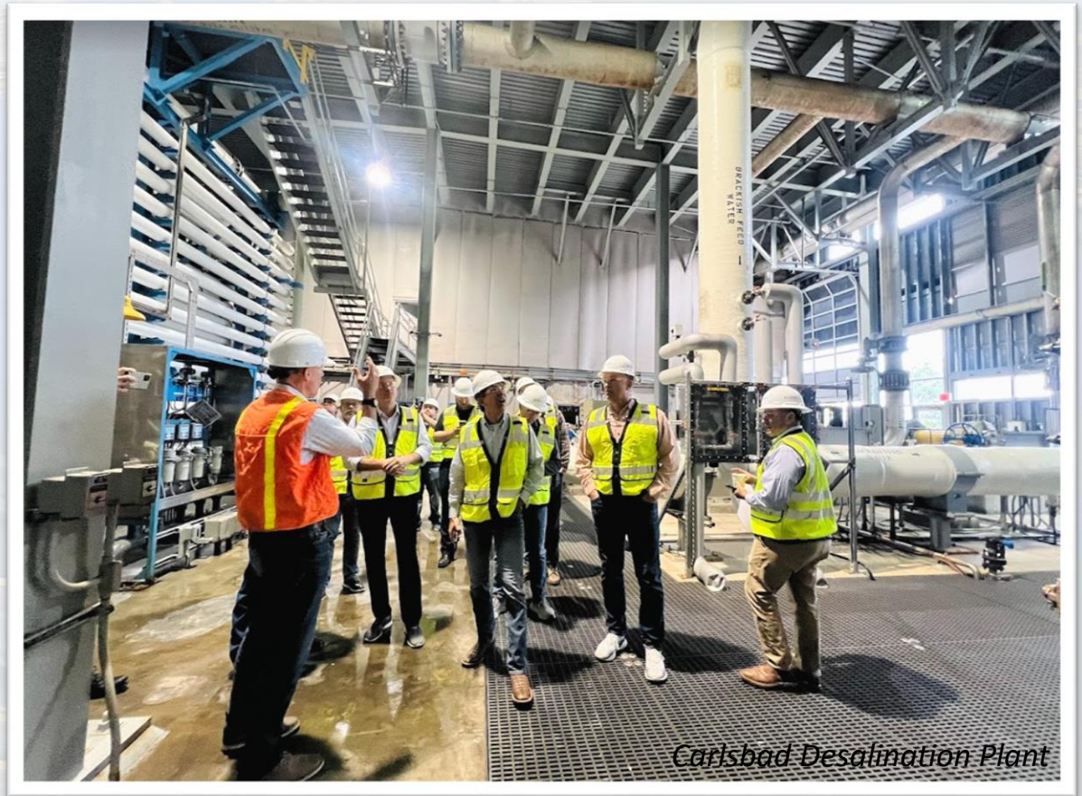
Carlsbad Desalination Plant

Approve the short-listed firms for the Inner Harbor Seawater Desalination Treatment Plant Project.