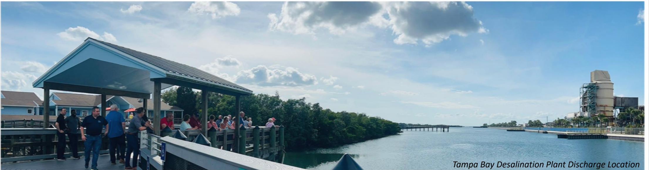
Tampa Bay Desalination Plant Discharge Location