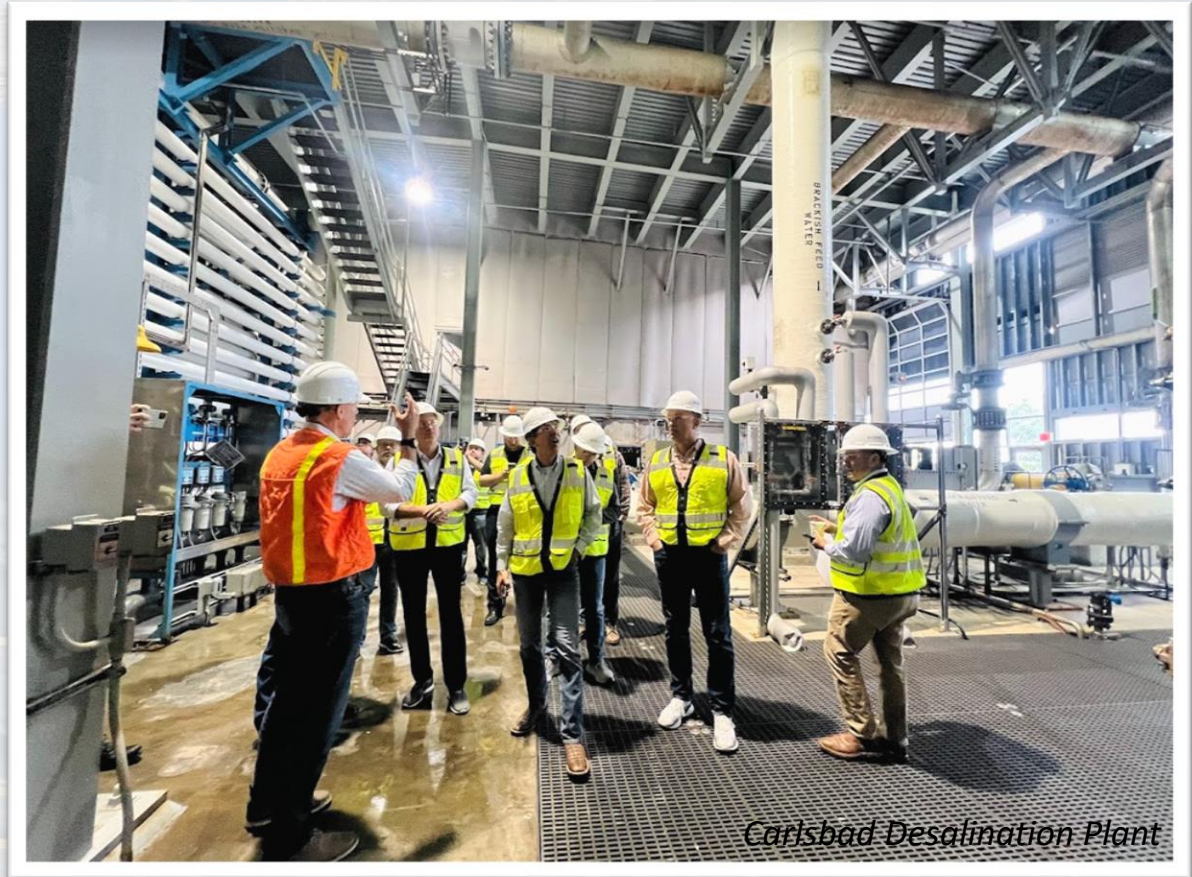
Carlsbad Desalination Plant

Approve the short-listed firms for the Inner Harbor Seawater Desalination Treatment Plant Project.