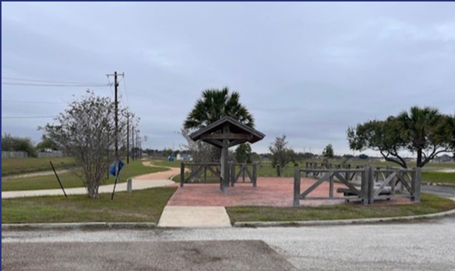
Bear Creek Hike & Bike Trail Junction