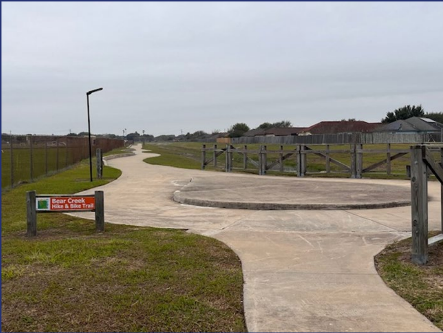
Bear Creek Hike & Bike Trail Head at Yorktown Blvd (North)