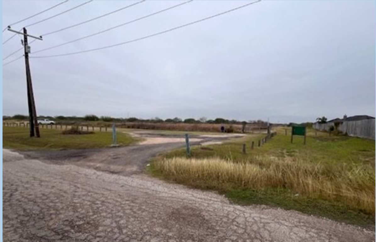
Oso Creek Park at Safety Steel Drive (South)