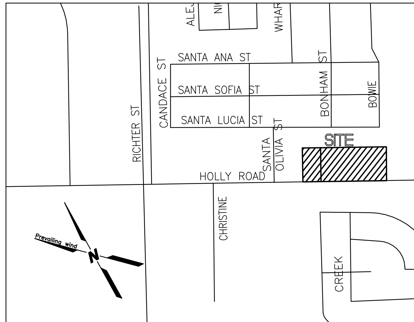
LOCATION MAP SCALE: 1"=800'

KARA SANDS COUNTY COURT NUECES COUNTY, TEXAS