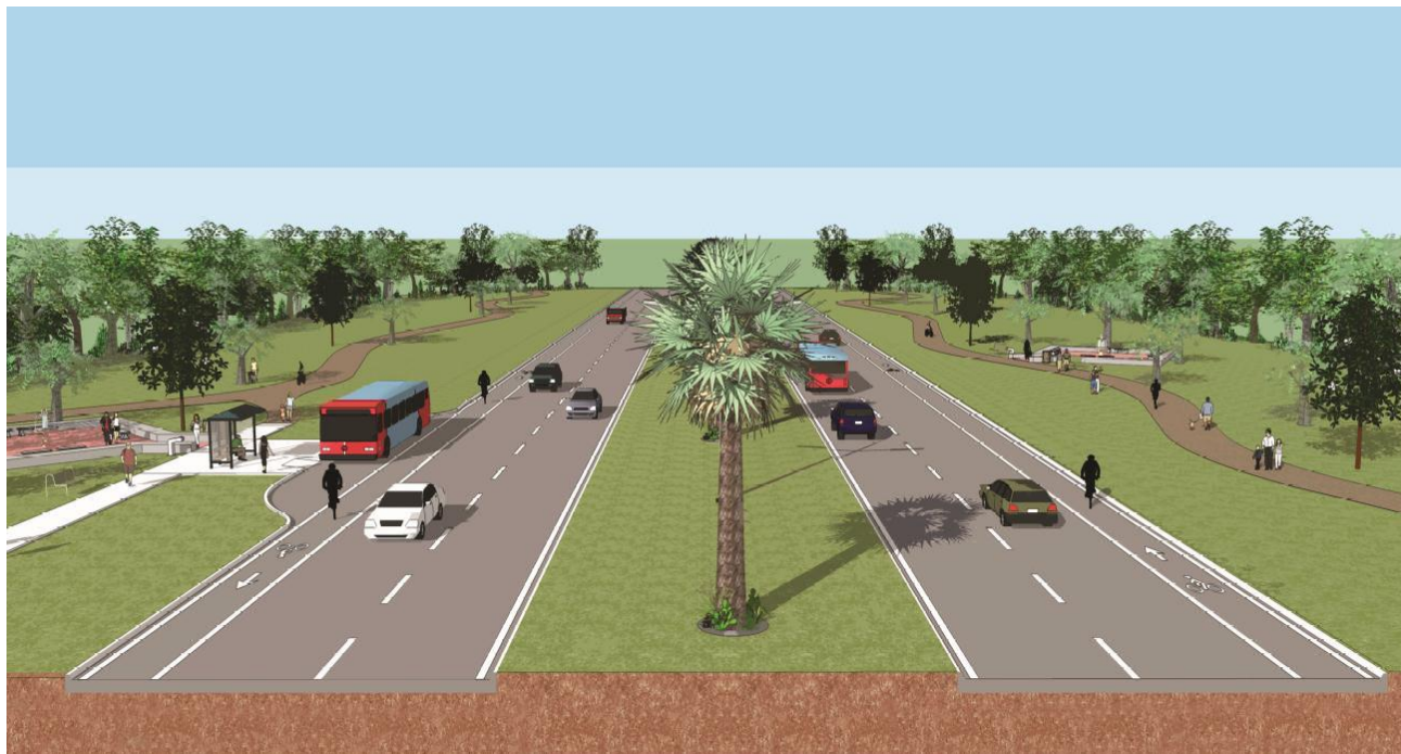
Rendering of the Parkway Concept