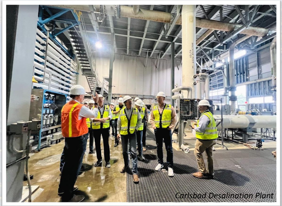
Carlsbad Desalination Plant

Approve the short-listed firms for the Inner Harbor Seawater Desalination Treatment Plant Project.