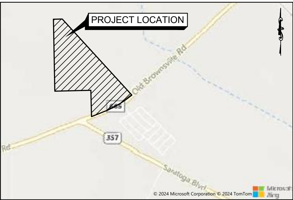
LOCATION MAP SCALE: 1" = 2,000'