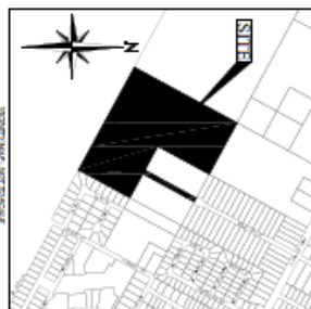
EXHIBIT B FOR PROPOSED RE-ZONING Christo Cove Subdivision Corpus Christi, Texas

FOR INFORMATION ONLY THIS PLAN IS NOT TO BE USED FOR CONSTRUCTION WITHOUT THE APPROVAL OF THE LOCAL AUTHORITY