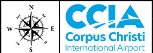
EXHIBIT B WEST BREEZEWAY STORAGE AREA 1000 International Drive Not to Scale Sheet No. 2 of 2

Prepared by: Randy Schumann Approved by: Victor Gonzalez Date: 07/16/2025