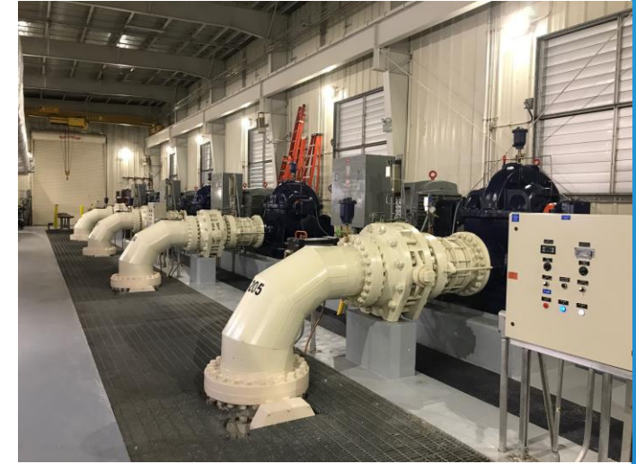
Woodsboro Pump Station