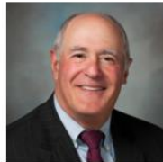
Kel Seliger Former Texas Senator