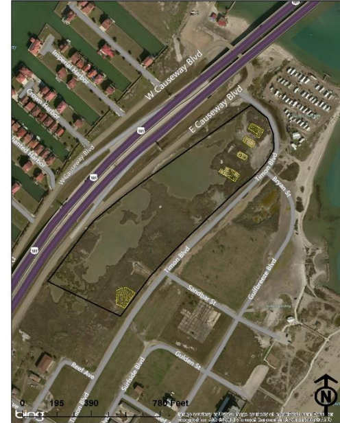
Harbor Bridge Project: Potential Mitigation Site

* Note: The parcel is an approximate representation of the city lot.