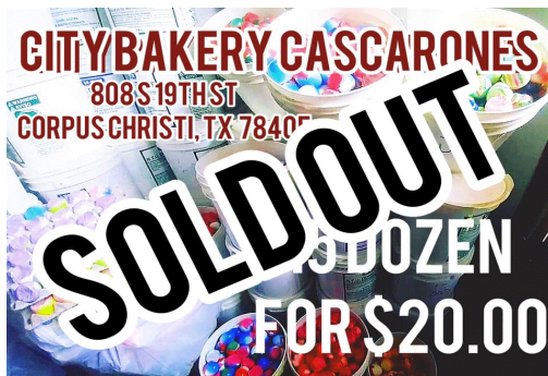
Figure 5 Advertisement on Facebook page