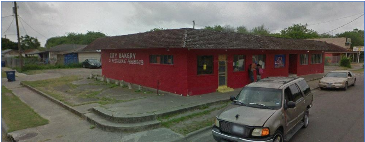
Figure 4 810 S. 19th St. at Coleman Ave.