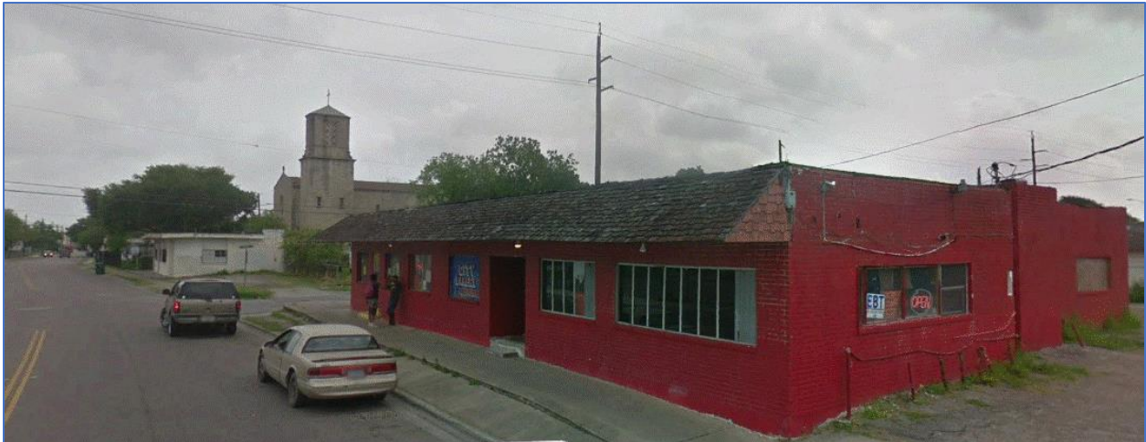
Figure 2 810 S. 19 th St. with St. Joseph's Church in background, Google Earth, 2021

The bakery building at 810 S 19 th St. is a one story building, mid-20 th century commercial block style, constructed circa 1962 of cement block with a masonry brick façade. It has a flat roof, with a slight parapet. A mansard style shingle canopy was added on the storefront. The entrance on 19 th St. has a double door which is flanked by metal frame glass windows. The storefront also has a secondary single door entrance. A cement block addition is on the east side of the main building.