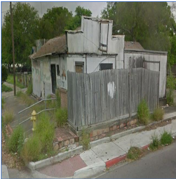
Figure 1 521 S. 19th St., Google Earth, 2021