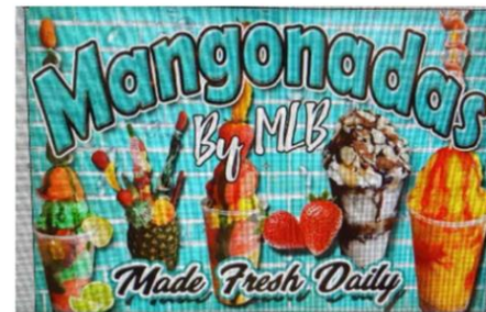
Chocolate Cover New York Cheesecake $5.00 Chocolate Cover Bananas $4.00