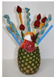
Pina Loca $12.00

7 different flavors of sorbet with fresh fruit sticks and candy sticks