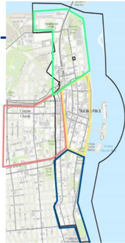
Exhibit A – Boundaries & Land Use