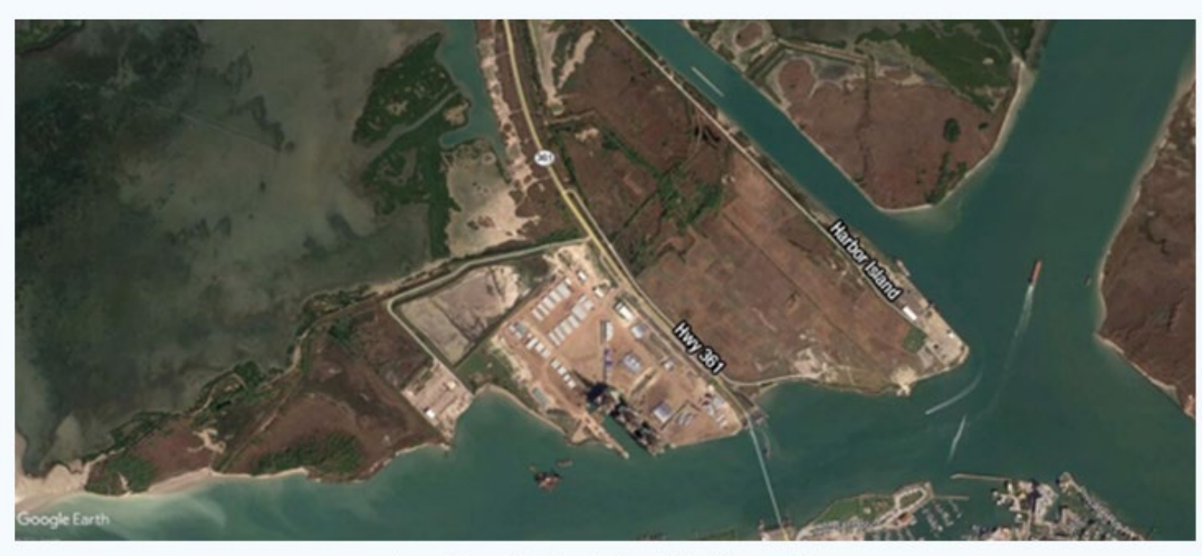
Location of actual desal facility on HI