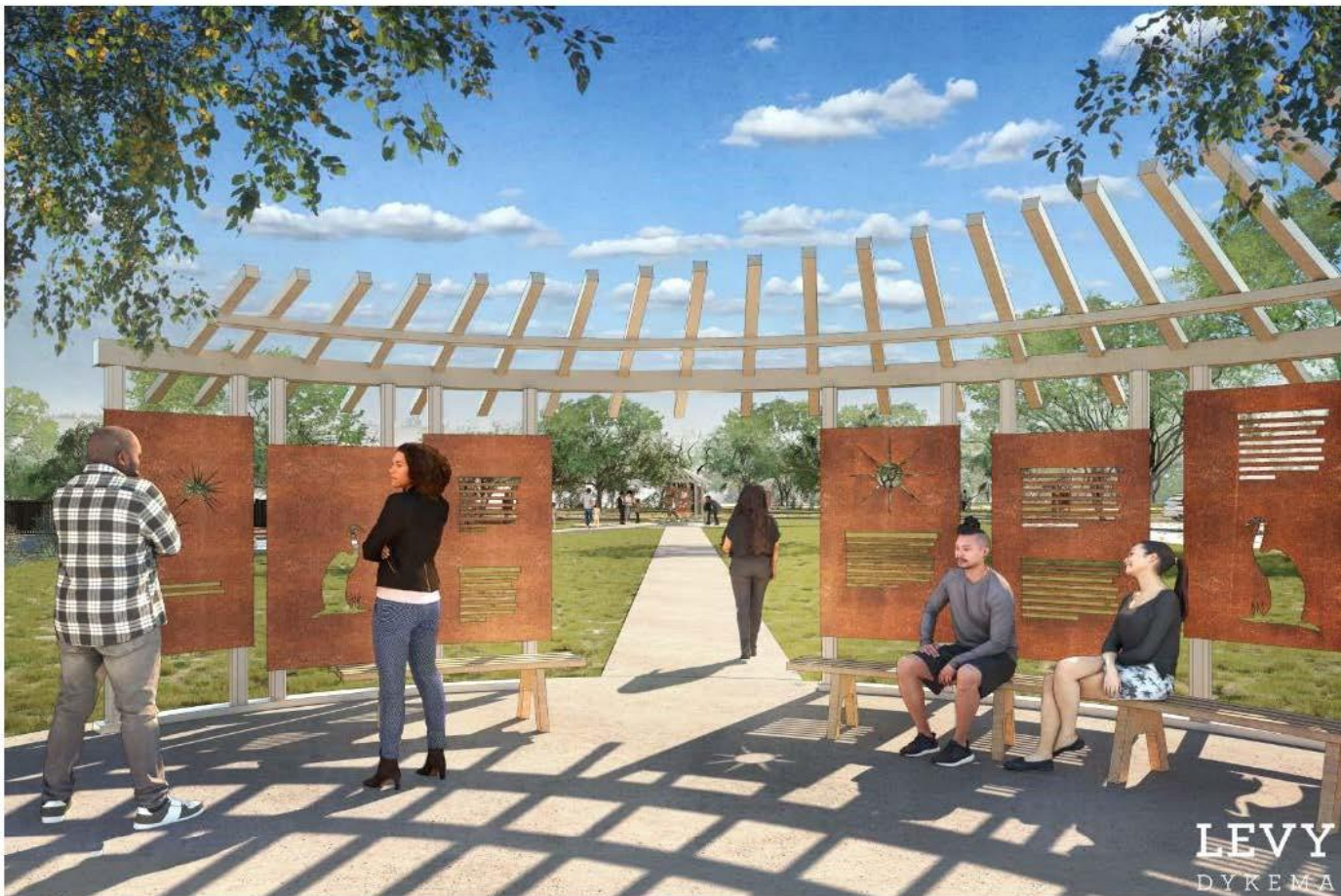
Rendering from Levy Dykema, Architects, for the Ishka Project