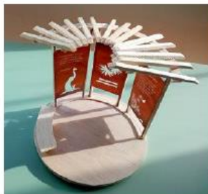
10 Ft. Shade Circles – 5 each