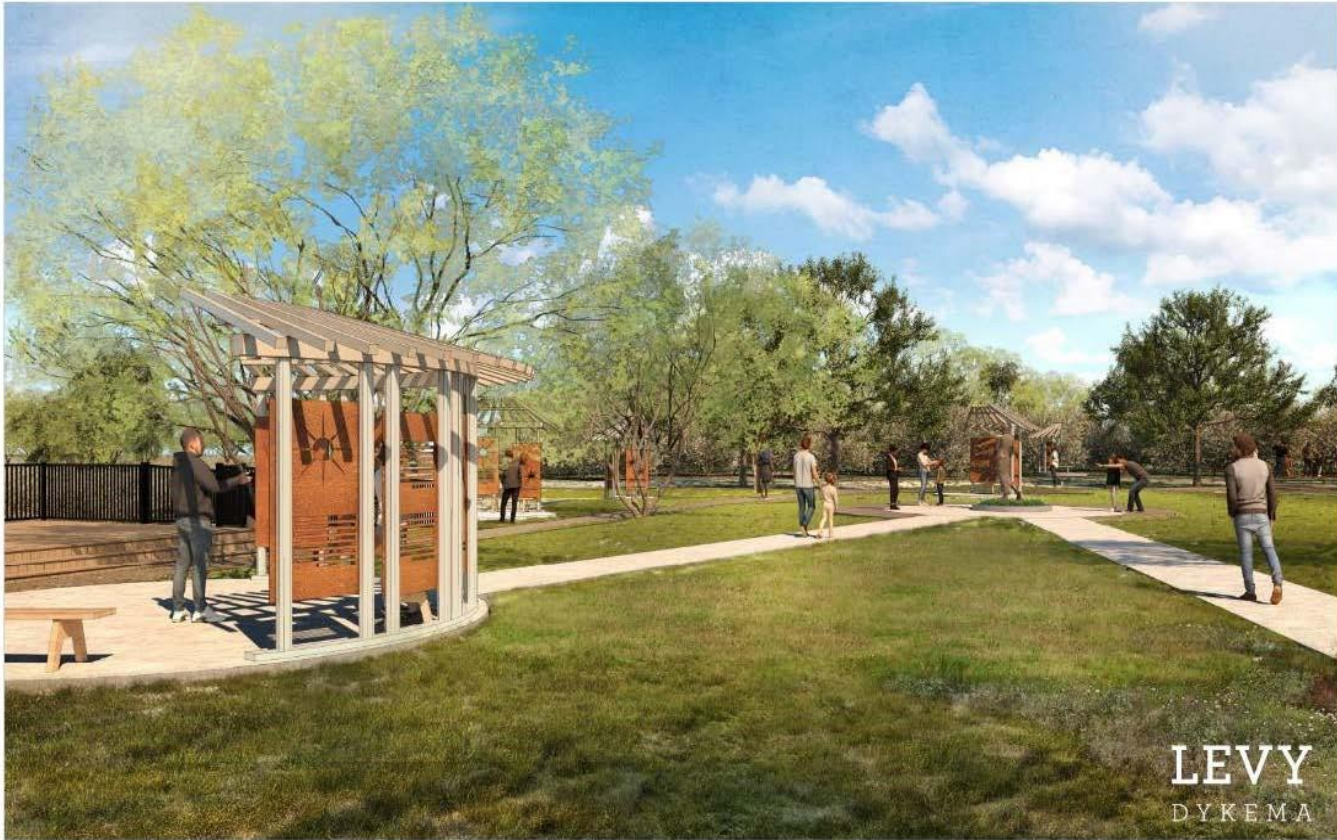
for the Ishka Project