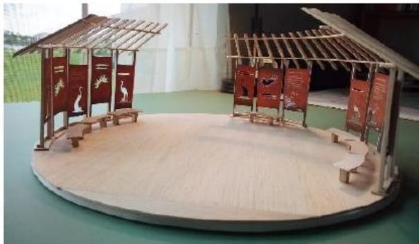
30 Ft. Gathering Circle