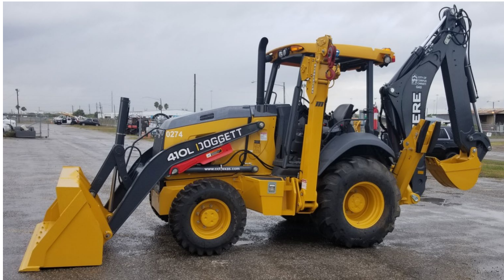
John Deere 410P Backhoe Loader with Side Boom Gas Department Qty: 2