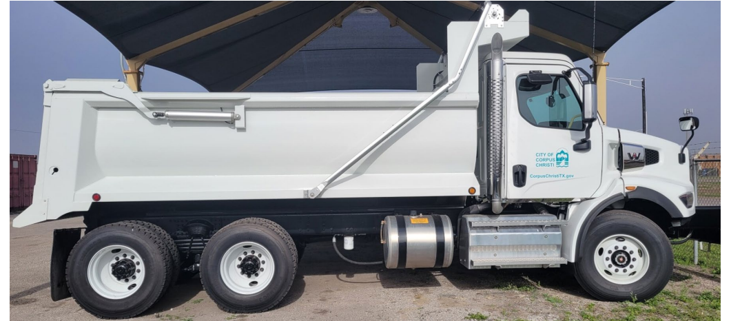
Western Star 49X 18 YD Dump Truck Public Works Stormwater Qty: 2