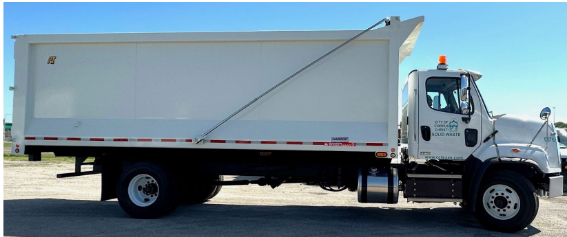
Freightliner 108SD Brush Trucks Solid Waste Qty: 2