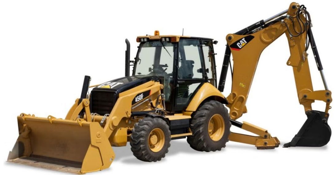
Cat 450 Backhoe Loader CCW Wastewater Qty: 1