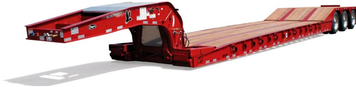
Etnyre 50 Ton Low-boy Trailer Public Works Street Qty: 1