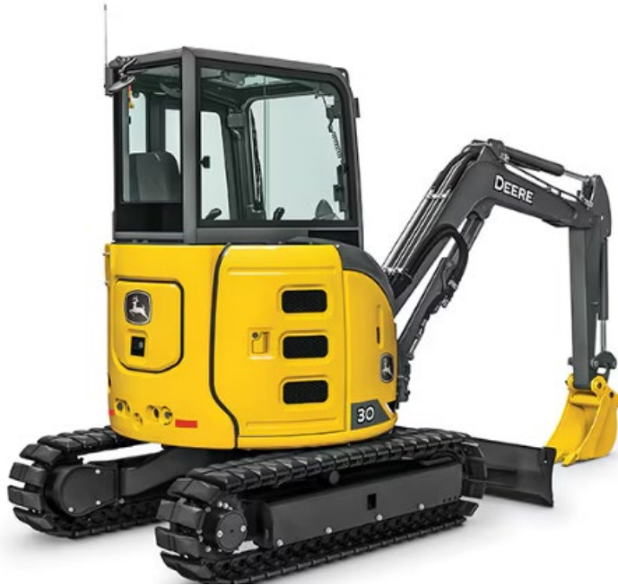
John Deere 30P Excavator Gas Department Qty: 1