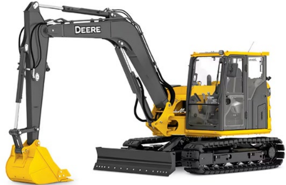
John Deere 85P Excavator Gas Department Qty: 1