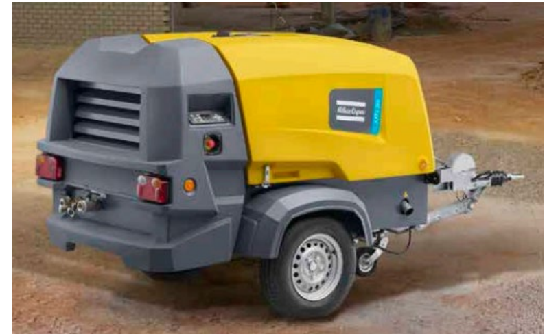
Trailer Mounted Air Compressor CCW Wastewater Qty: 1