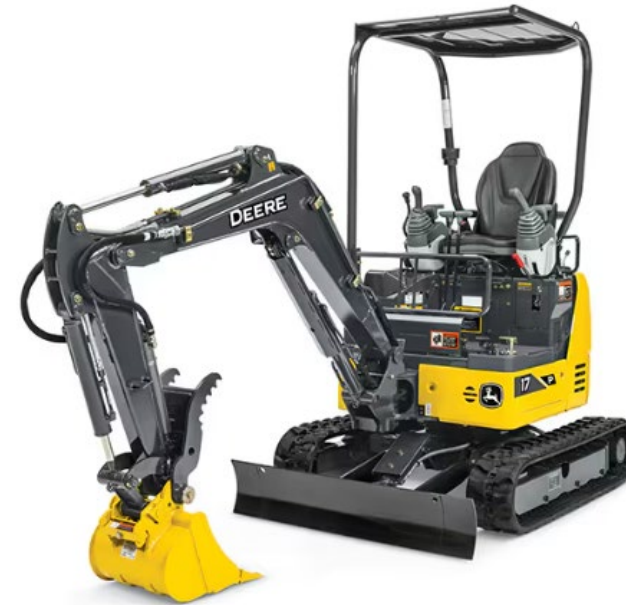
John Deere 17P Excavator Gas Department Qty: 2