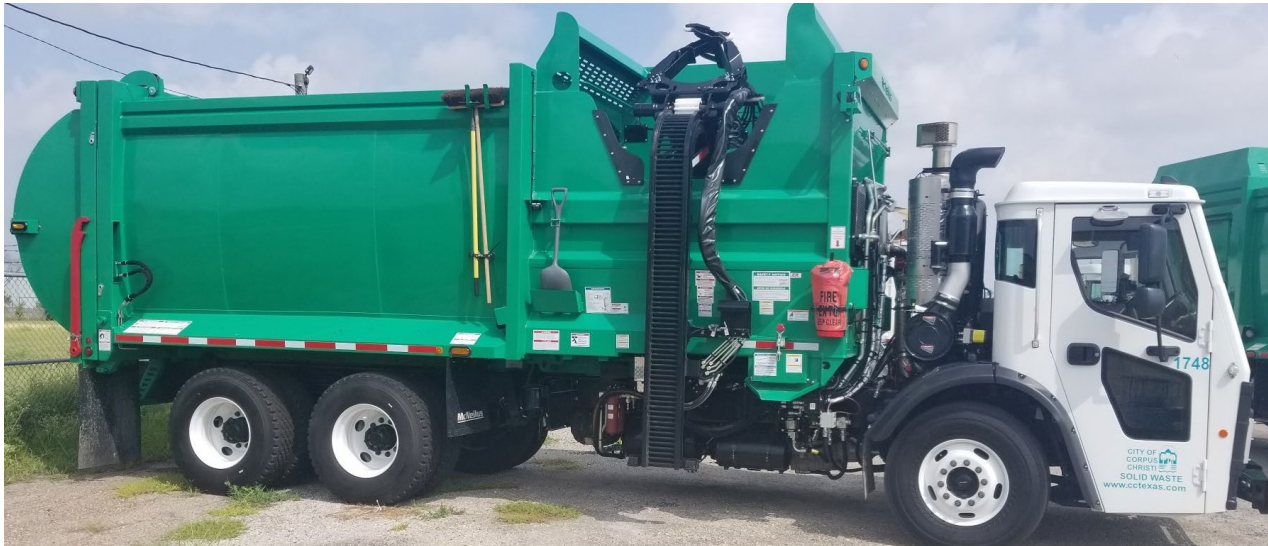
Mack with McNeilus Automated Side Loader Refuse Truck Solid Waste Qty: 1