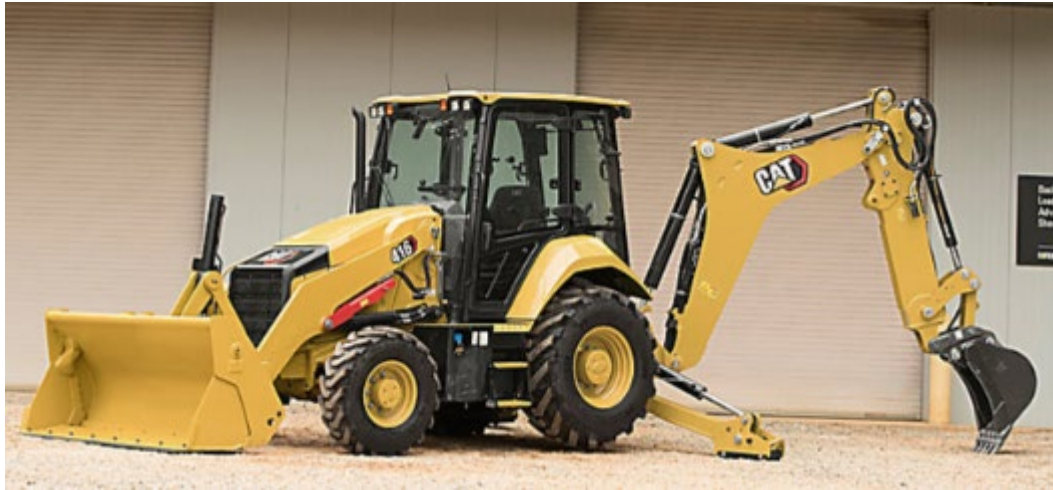
Cat 416 Backhoe Loader CCW Wastewater Qty: 1