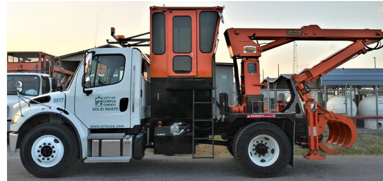
Freightliner M2-106 RS3 Rear Steer Solid Waste Qty: 2