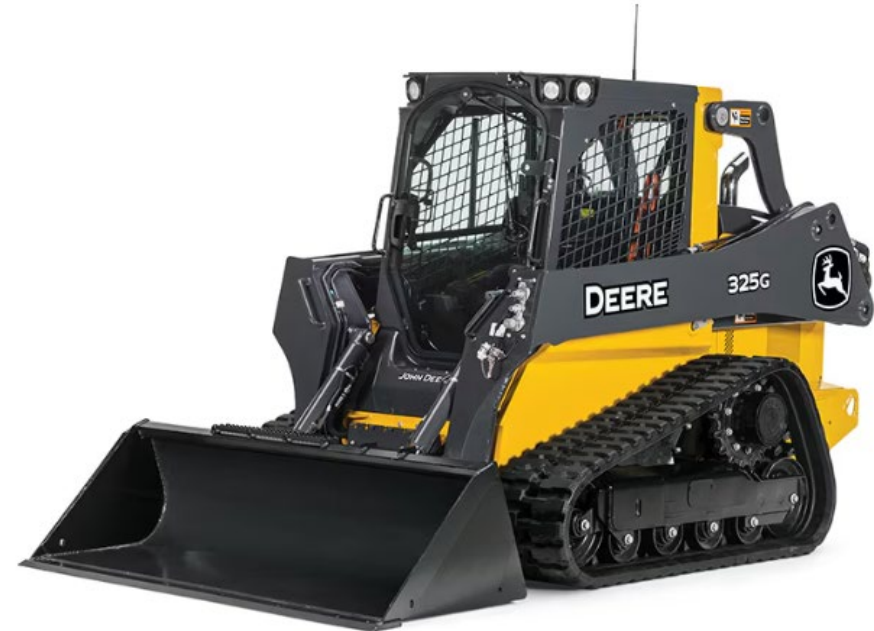
John Deere 325G Track Loader with bucket, broom, and rotary mower Parks and Recreation Qty: 1