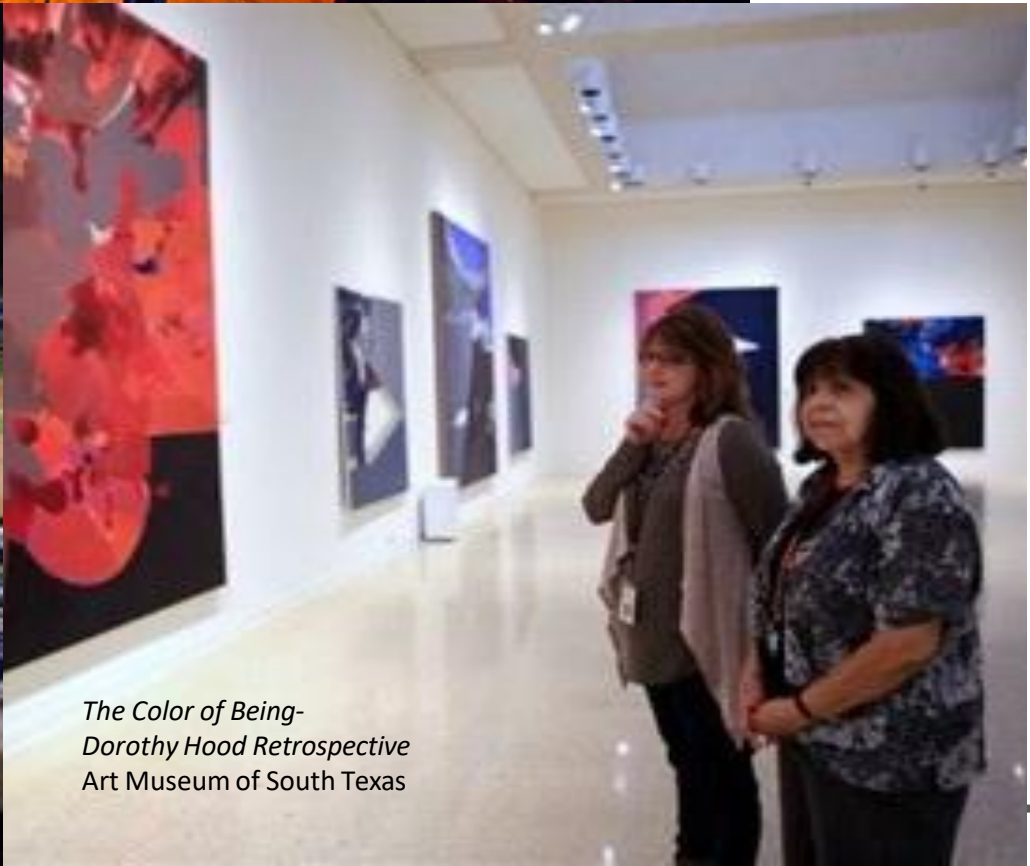
The Color of Being- Dorothy Hood Retrospective Art Museum of South Texas