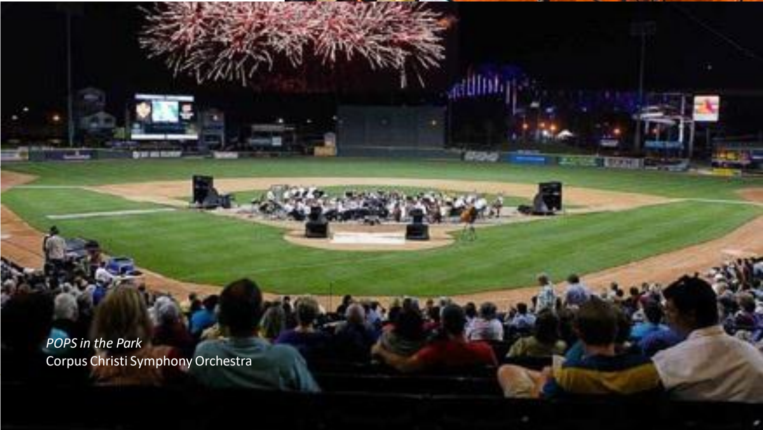
POPS in the Park Corpus Christi Symphony Orchestra