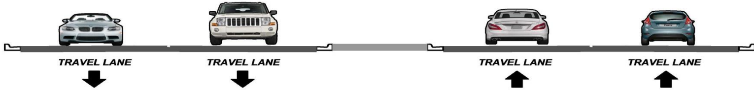
EXISTING BOULEVARD SECTION AT WILLIAMS DRIVE