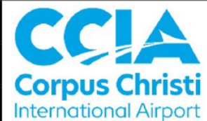
EXHIBIT B WEST BREEZEWAY STORAGE AREA 1000 International Drive