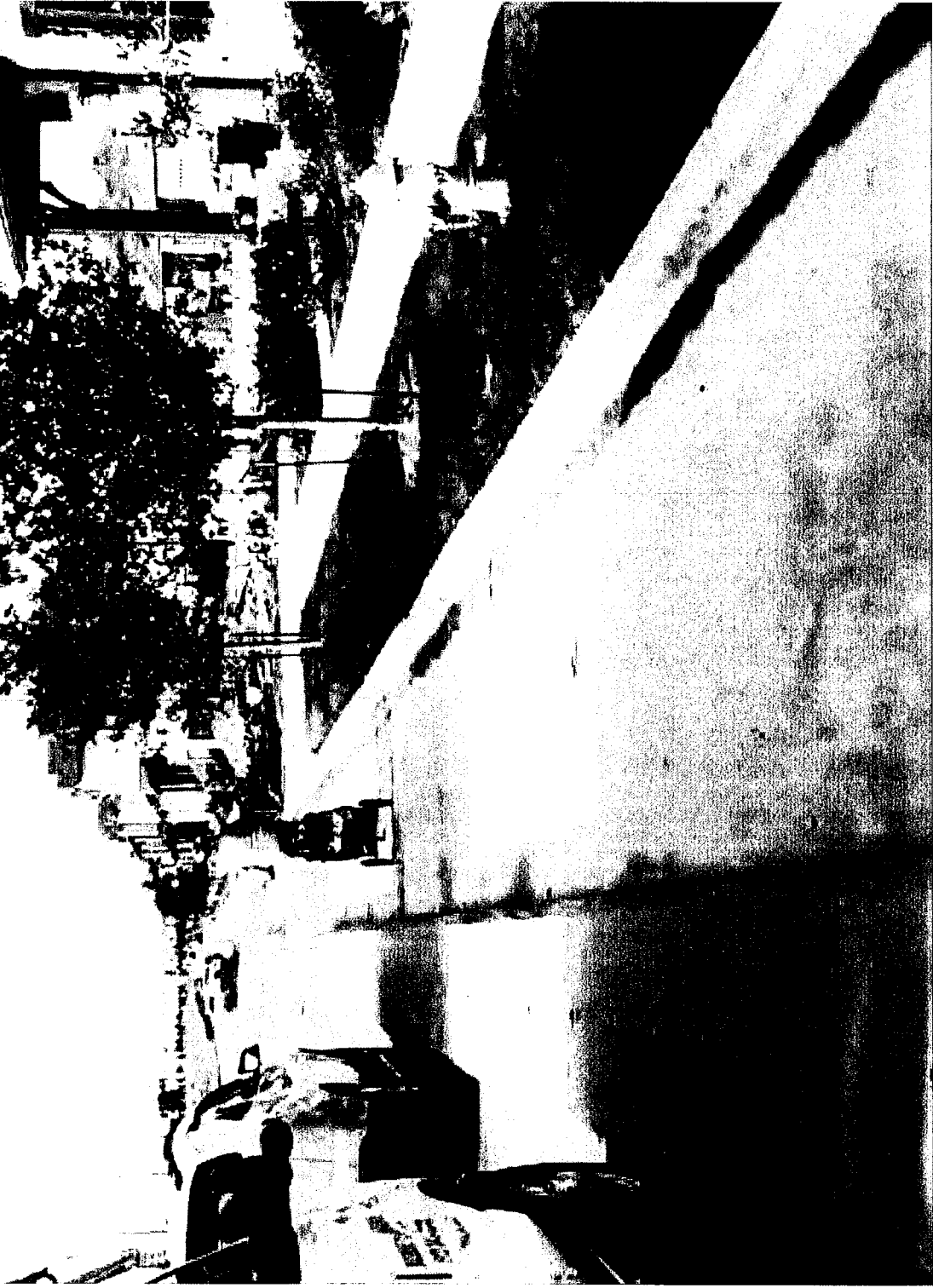
Austin, TX

Concrete curbs can either be cast in place or precast. This element is more expensive to construct and install but provides