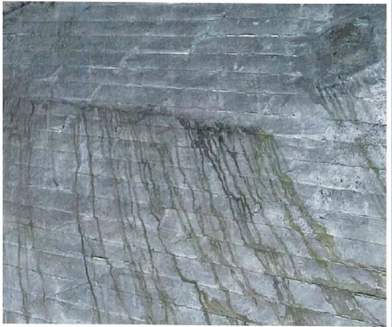
East GA Hangar No.1 Facing ceiling of Hangar.