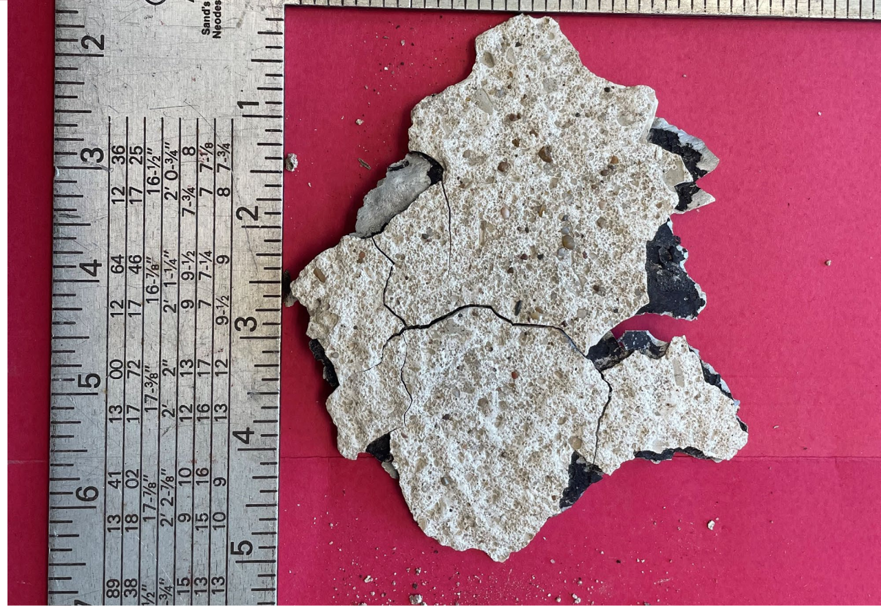
Concrete pieces fallen from Hangar 1 ceiling