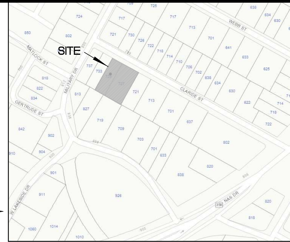
LOCATION MAP: N.T.S.

BEING A RE-PLAT OF THE EAST 50 FT OF LOT 2 AND WEST 35 FT OF LOT 3, BLOCK 5 OF FLOUR BLUFF ESTATES NO. 2, VOLUME 8, PAGE 22 OF THE MAP RECORDS OF NUECES COUNTY, TEXAS, TOGETHER WITH ALL OF LOT 2A, BLOCK 5 OF FLOUR BLUFF ESTATES NO. 2, VOLUME 63 PAGE 69 OF THE MAP RECORDS OF NUECES COUNTY, TEXAS