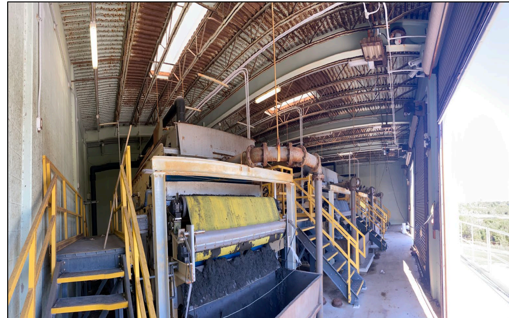
Dewatering Building Roof 2020