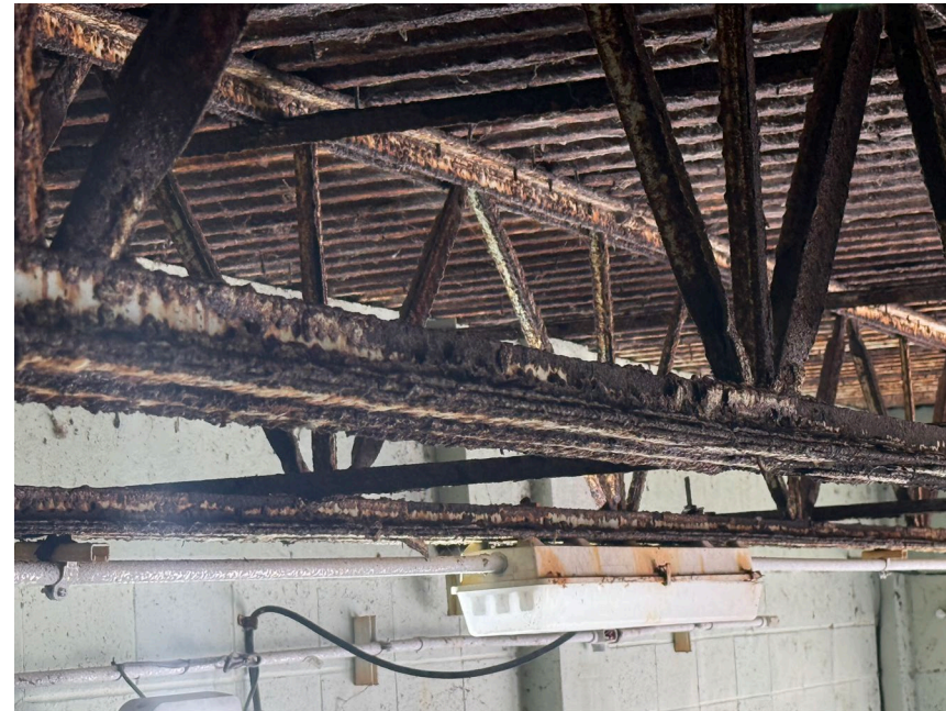
Dewatering Building Roof 2025