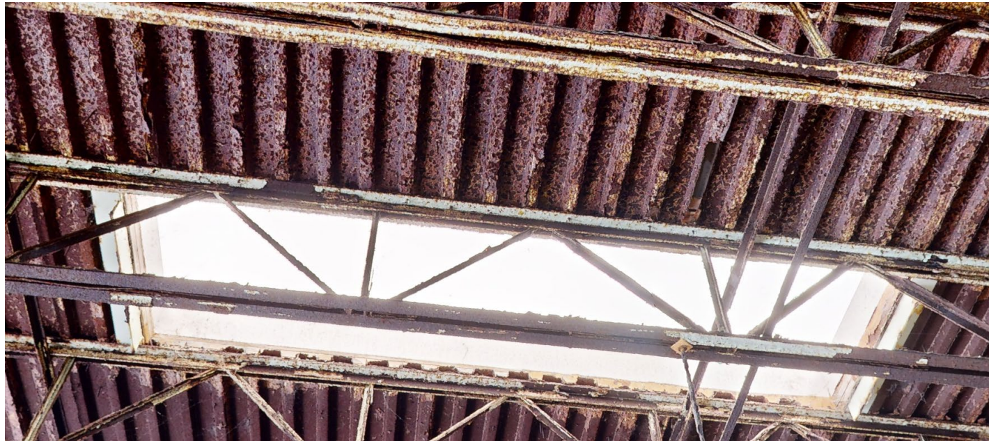
Dewatering Building Roof 2025