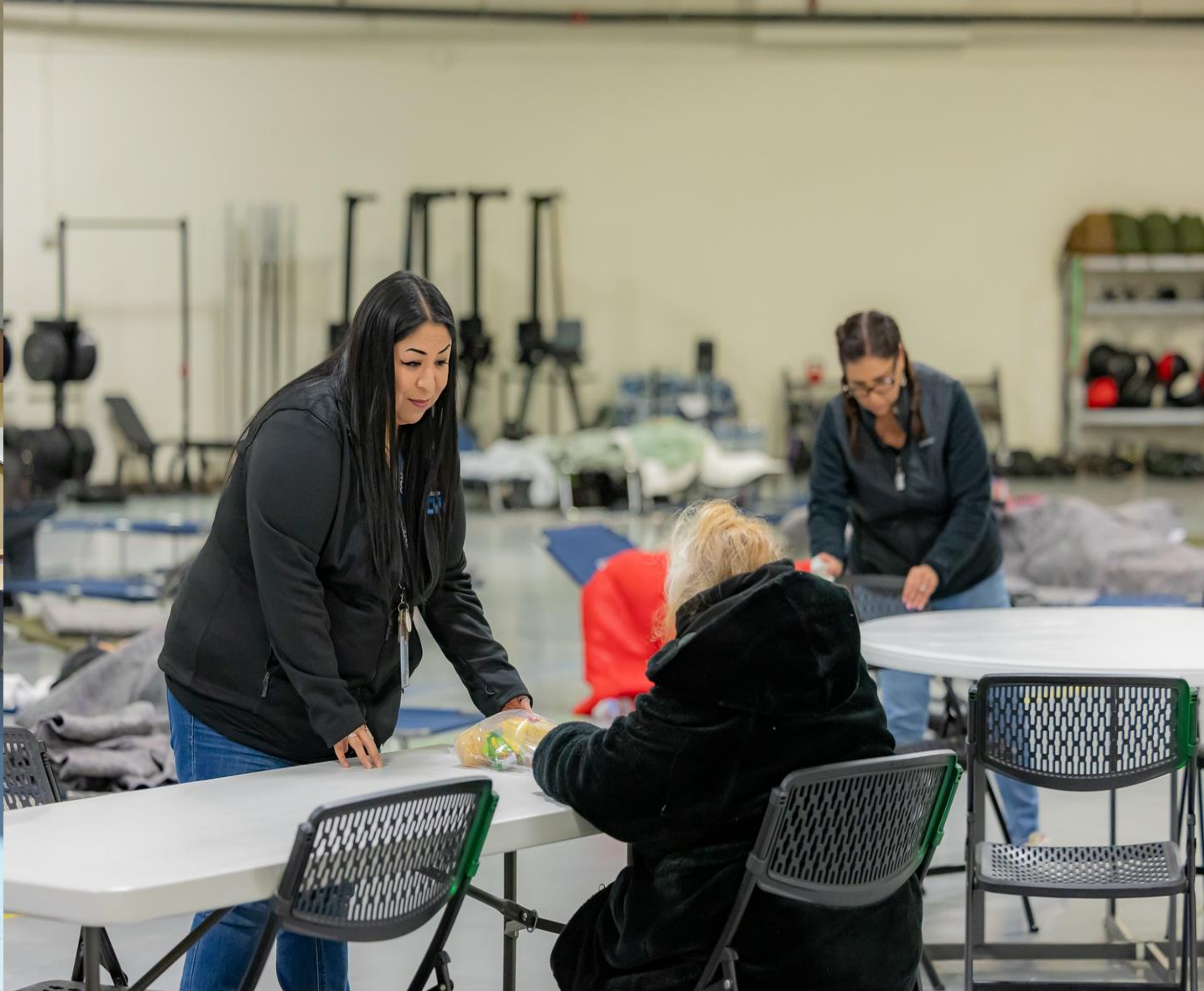
Emergency Response Operations