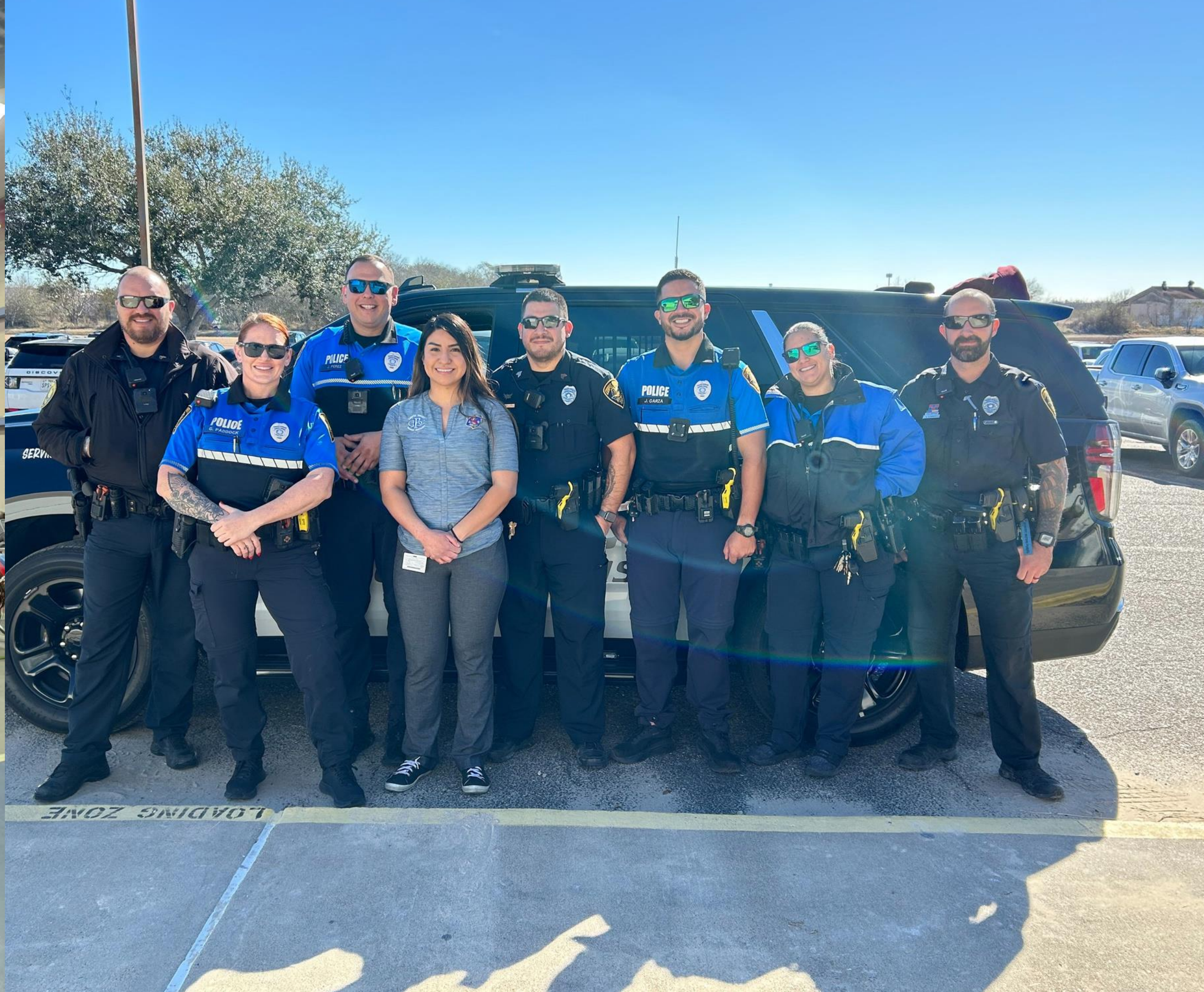
Emergency Response Operations