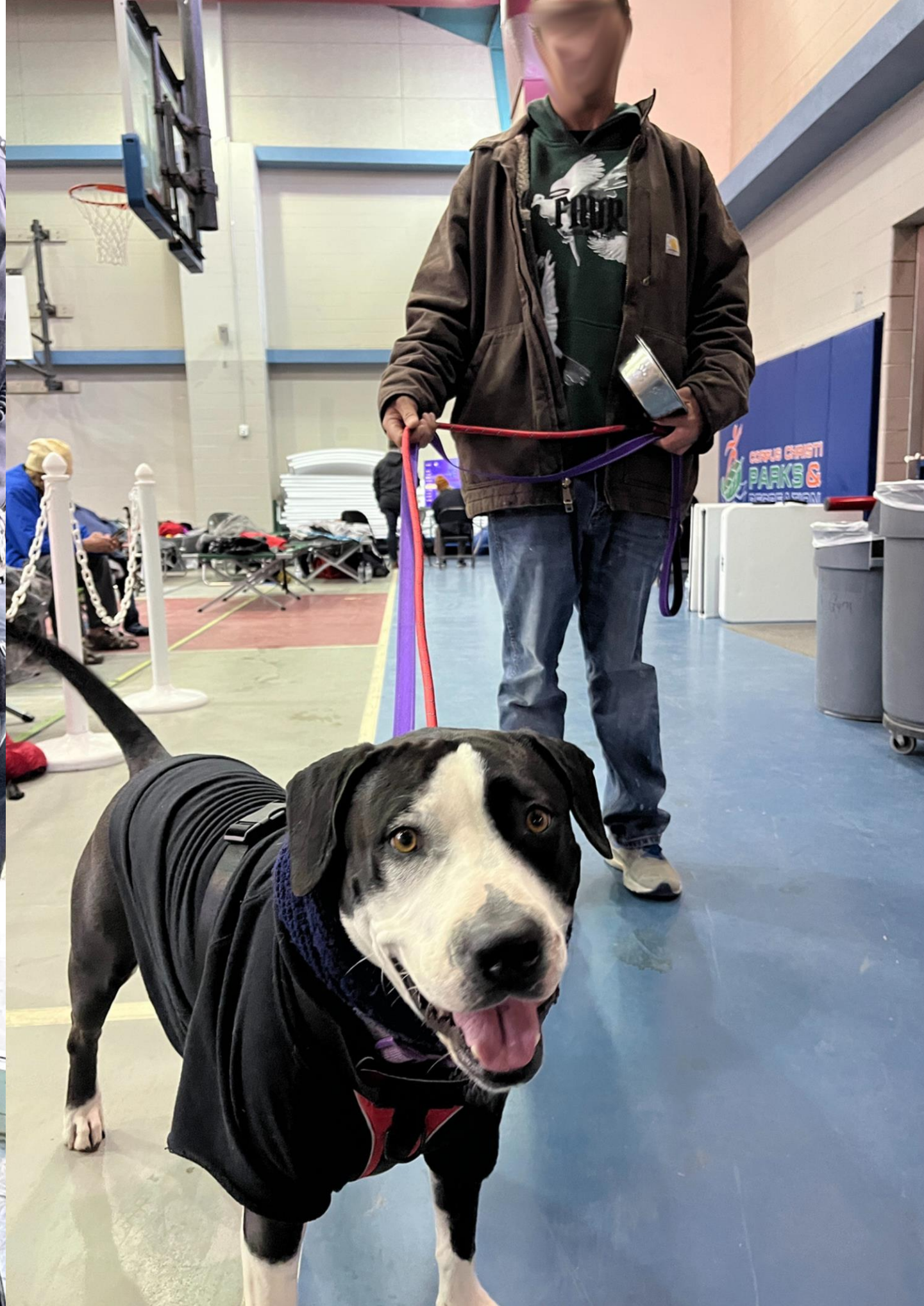
Emergency Response Operations