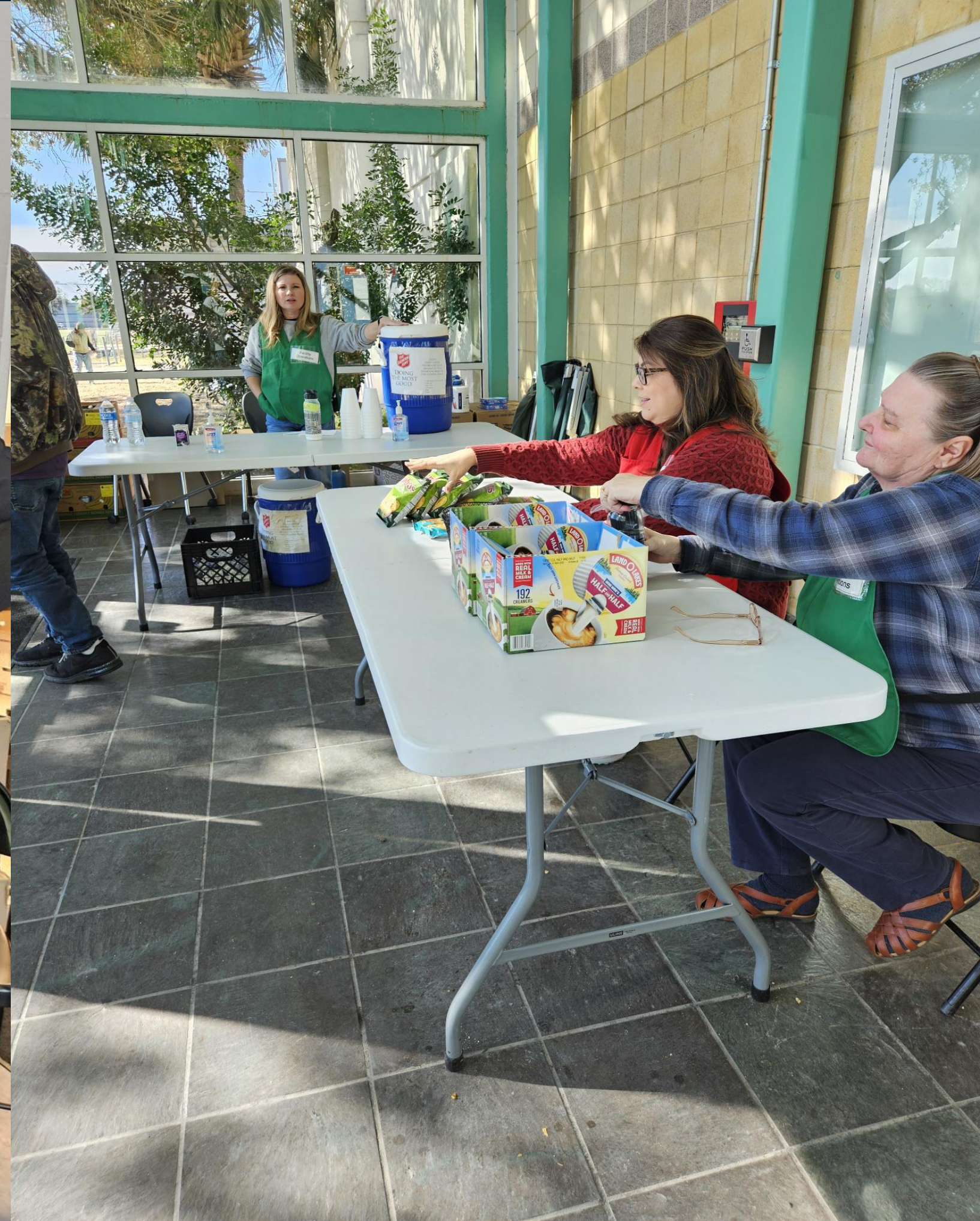
Emergency Response Operations