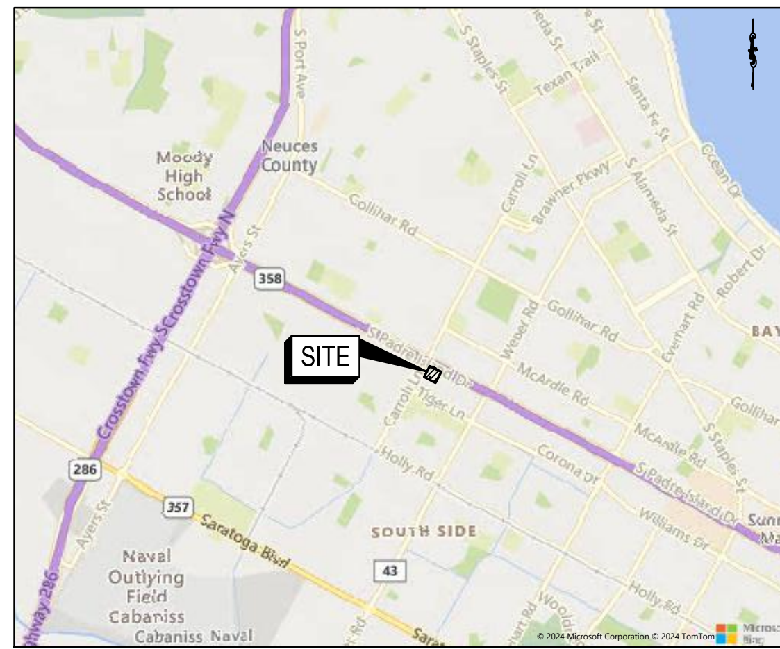
LOCATION MAP SCALE: 1" = 5,000'