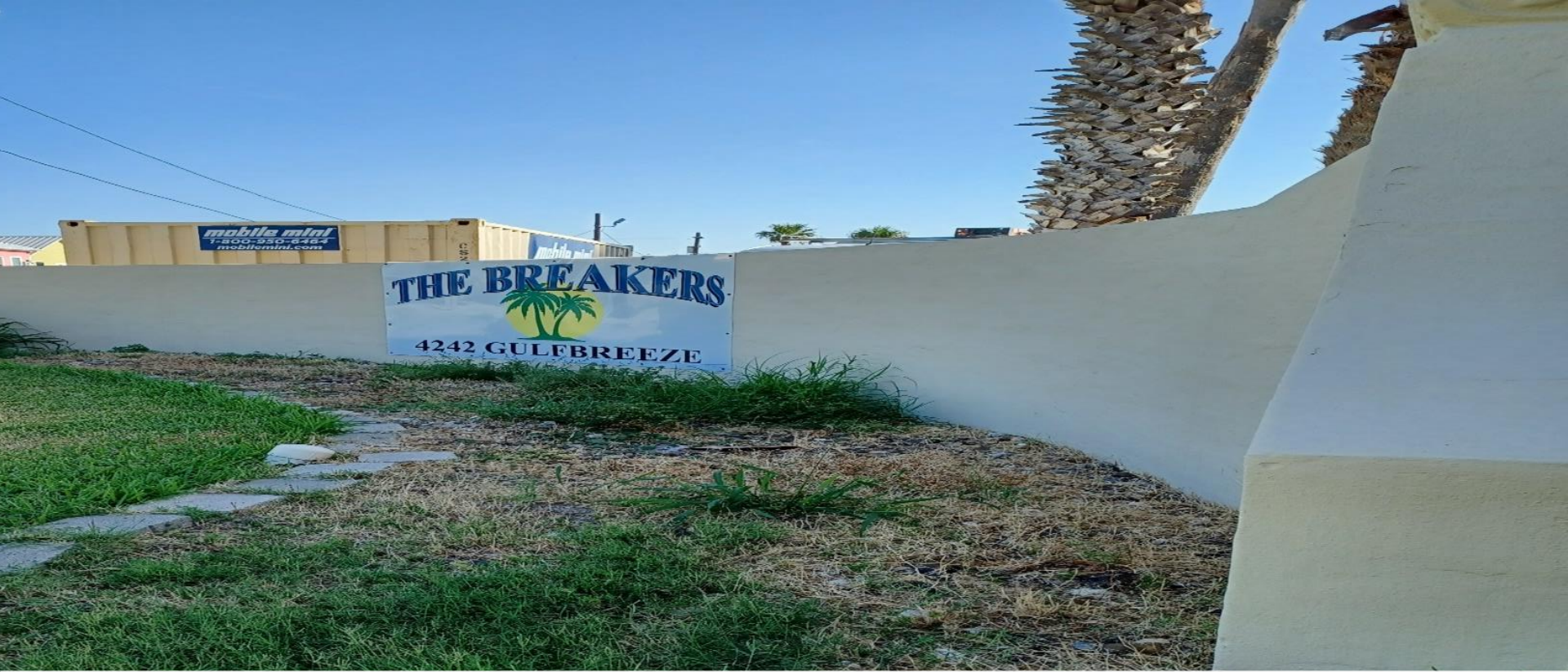
Current Conditions- Landscape