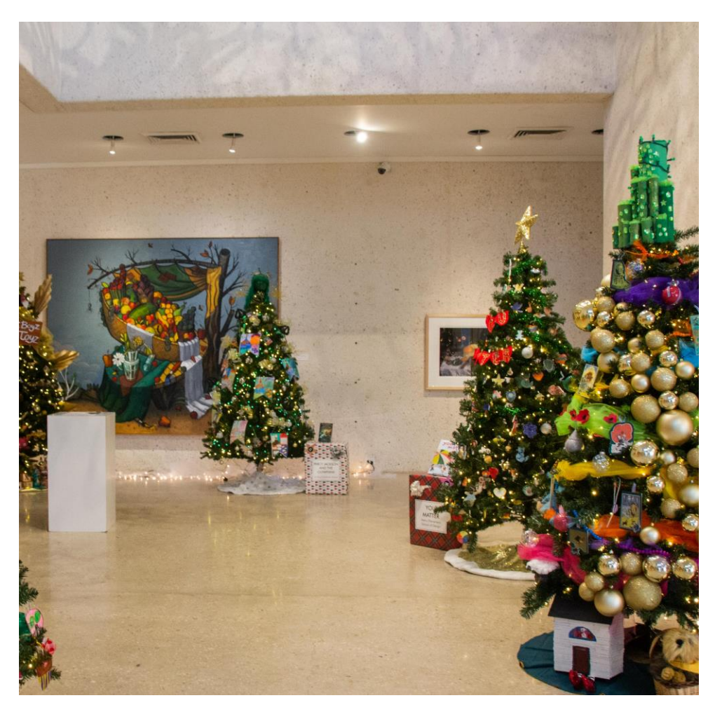
In Our Own Words: Native Impressions

TAMU-CC Art + Design 14<sup>th</sup> Annual Christmas Tree Forest Faculty Biennial