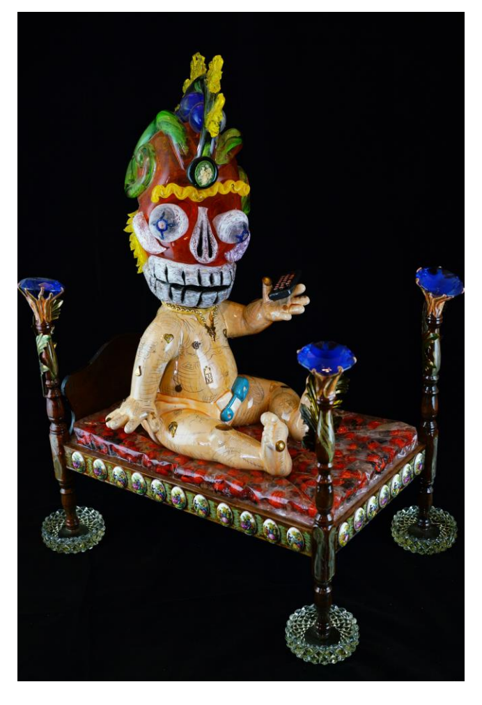
KARIN BROKER: my circus too