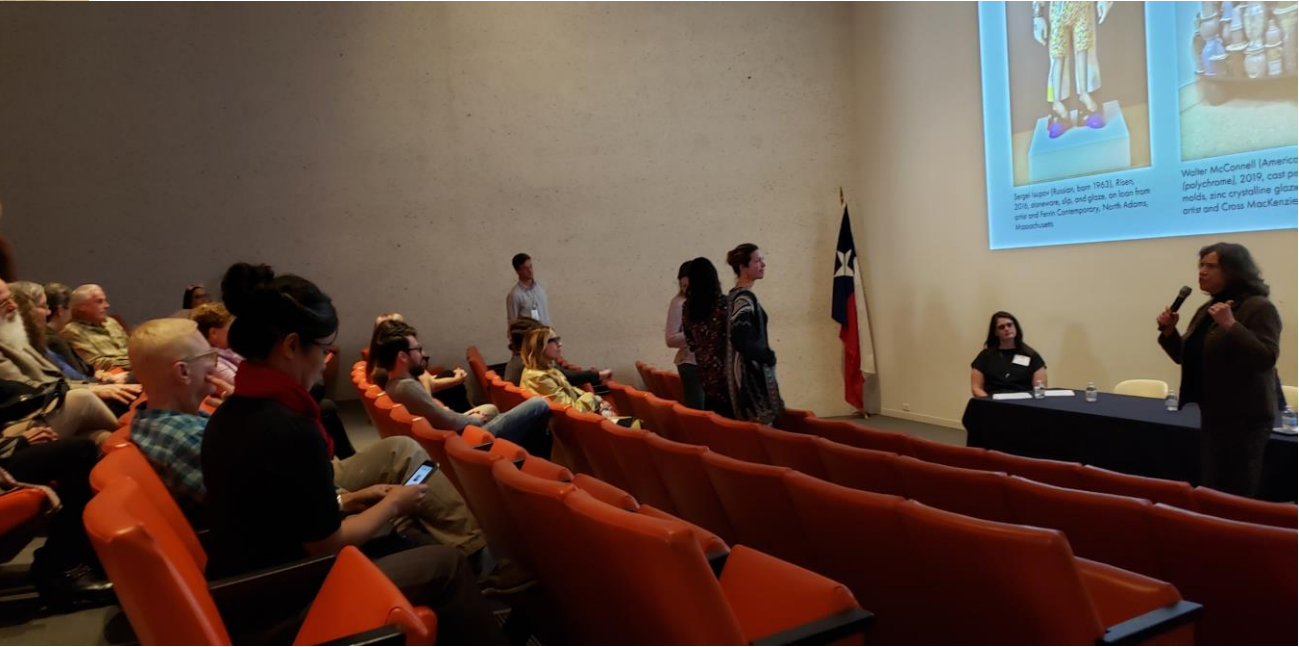
LUNCH AMONGST THE MASTERS