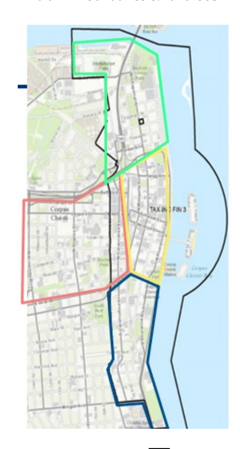
Exhibit A – Boundaries & Land Use