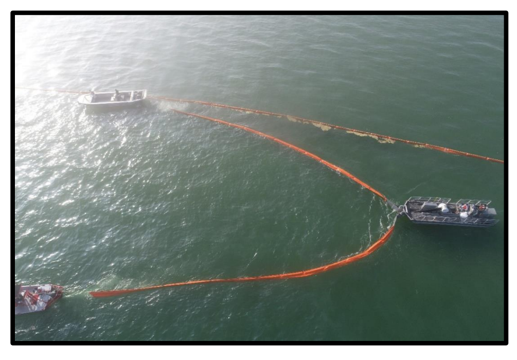
Photograph 4: V-boom strategy collecting product along protective boom.