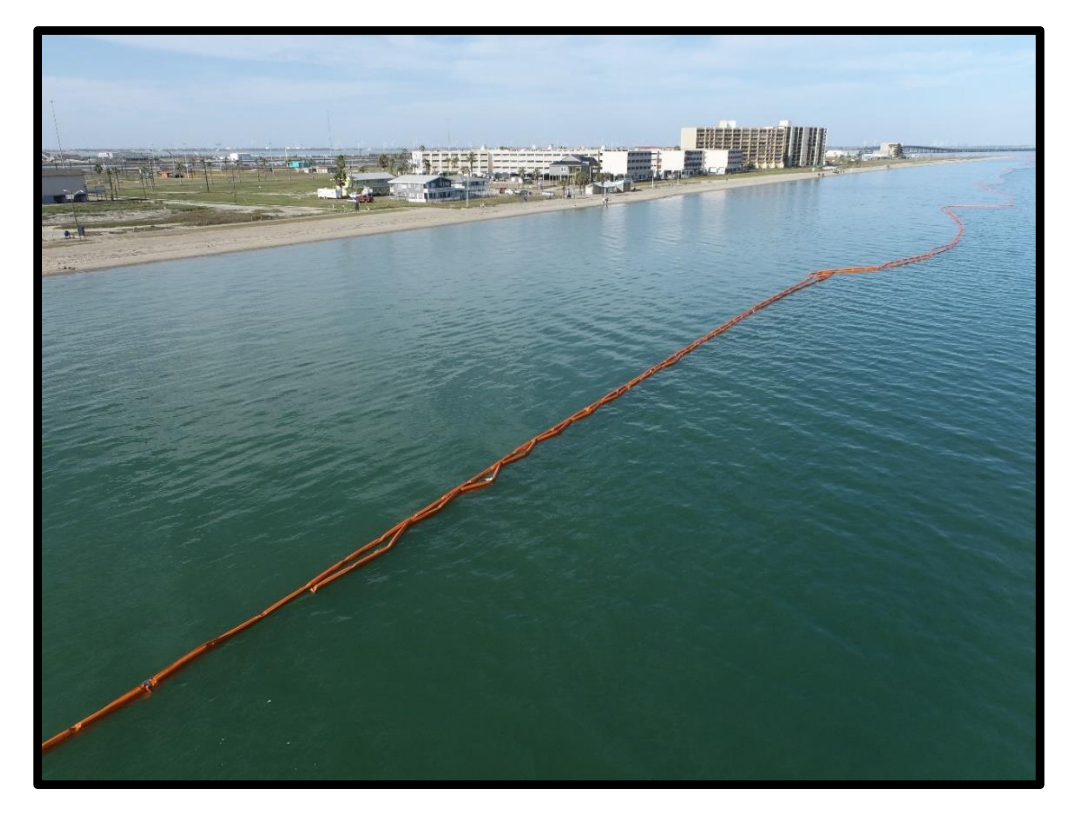
Photograph 5: Protective boom deployed along North Beach.