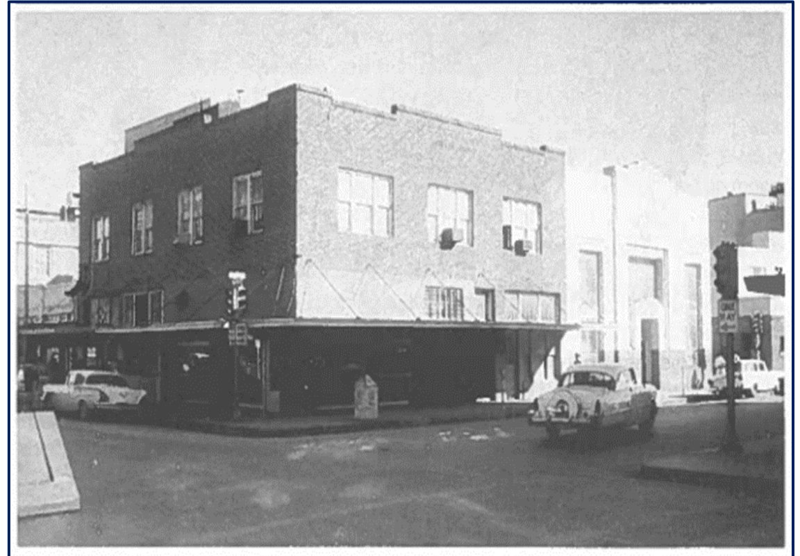
Seeligson Building / Current Building at 425 Peoples St