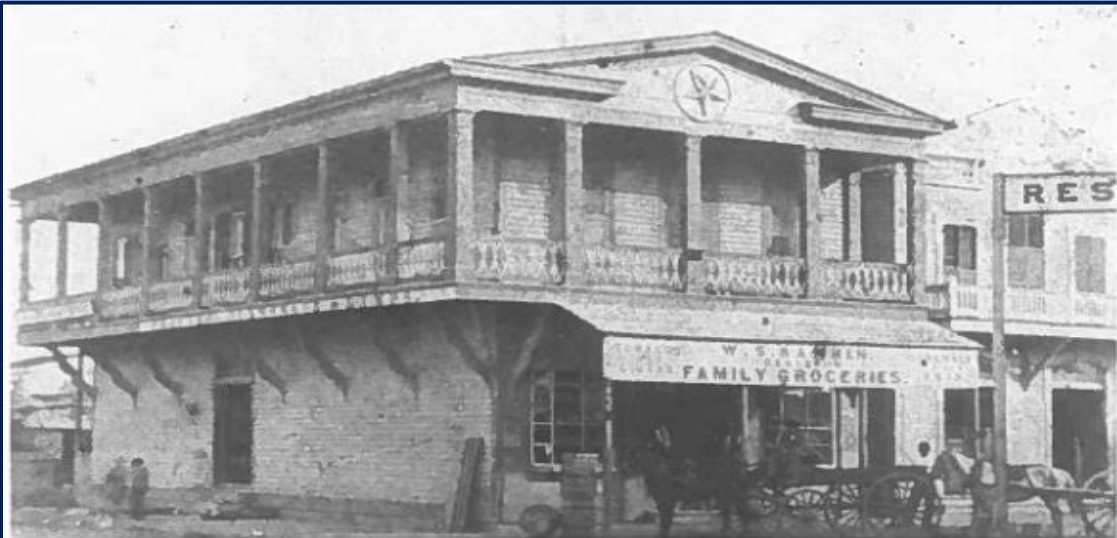
1880's: McCampbell Building