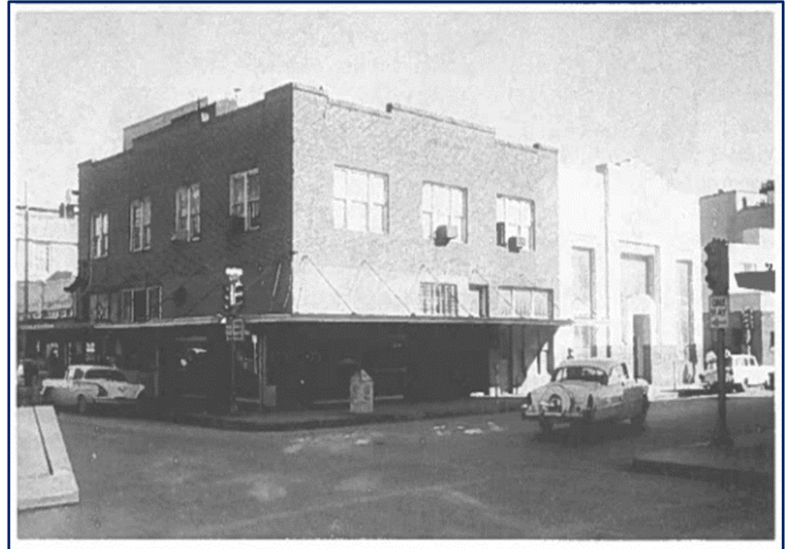
Seeligson Building / Current Building at 425 Peoples St