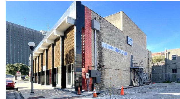
All Good Fitness