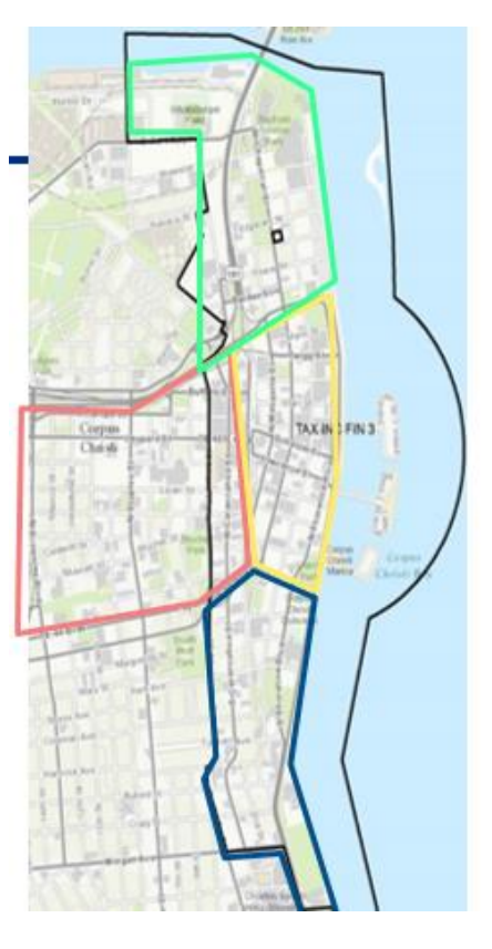
Exhibit A – Boundaries & Land Use