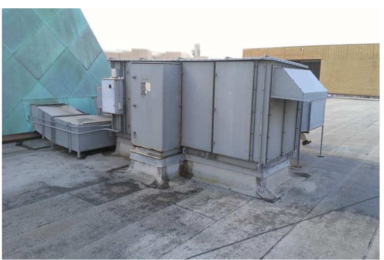
Alt. #2: Replacement of the roof-mounted air-handler unit installed with the original building construction.